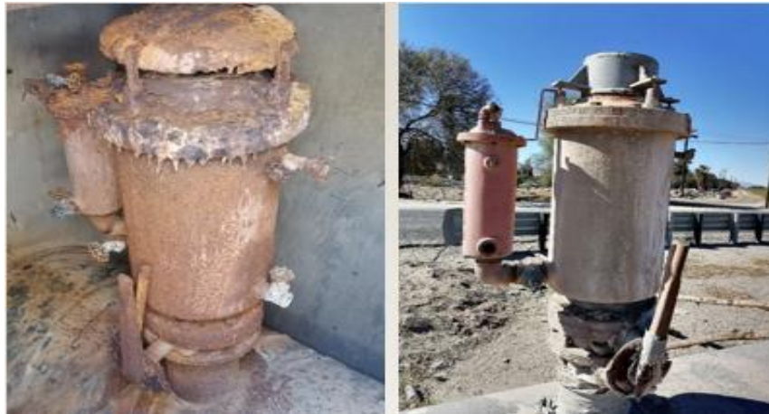
Figure 2 ACTUAL CONDITIONS OF AUTOMATIC AIR RELIEF VALVES

The Project is needed to protect public health and the environment by minimizing the risk of force mains breaks that can cause sewage overflows onto local streets and into the New River, which flows northward into the United States. For these reasons, the Project was prioritized for funding through the U.S.-Mexico Border Water Infrastructure Program of the U.S. Environmental Protection Agency (EPA).