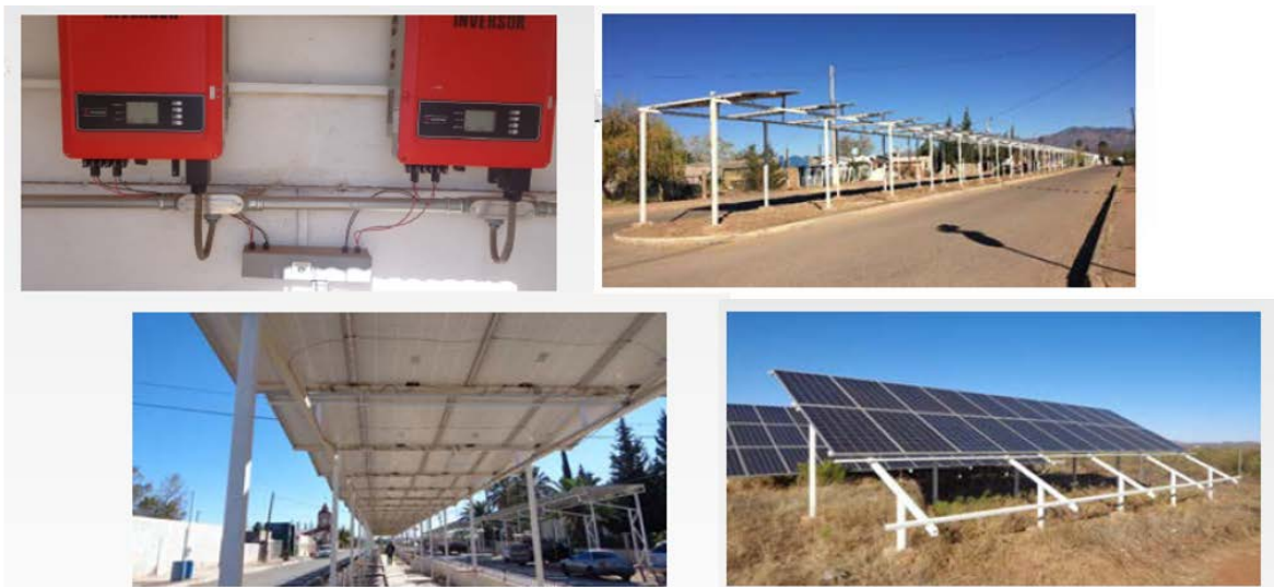
Figure 3 SOLAR PANEL SYSTEM

Although the solar panels and related components were installed in 2018, the system is not operational and requires additional investments to be connected to the grid. OOMAPAS also removed and stored some of the panels to protect them from vandalism or other threats. Additional information regarding the current condition of these components is provided in Section 3.1.3. below.