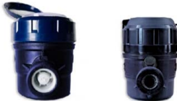
Figure 4 MULTIPLE JET VELOCITY METER

Velocity meters have a lid for maintenance, allowing for easy access to replace any parts. Remote reading provides real-time meter measurements and information about water use without the need for a home or site visit. The automated meter reading module receives a magnetic transmission of the volume of water delivered to each dwelling. The information is sent via radio frequency to the registration and data system. OOMAPAS staff will be trained in the use of the equipment once the new commercial system is available and as specified in either the purchase or installation agreement.