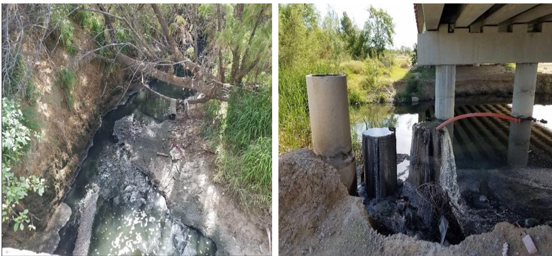
Figure 3 WASTEWATER SPILLS TO EL COYOTE CREEK

Figure 3 shows examples of wastewater spills into El Coyote Creek, a tributary of the Rio Grande River, which were identified in the November 2020 study.