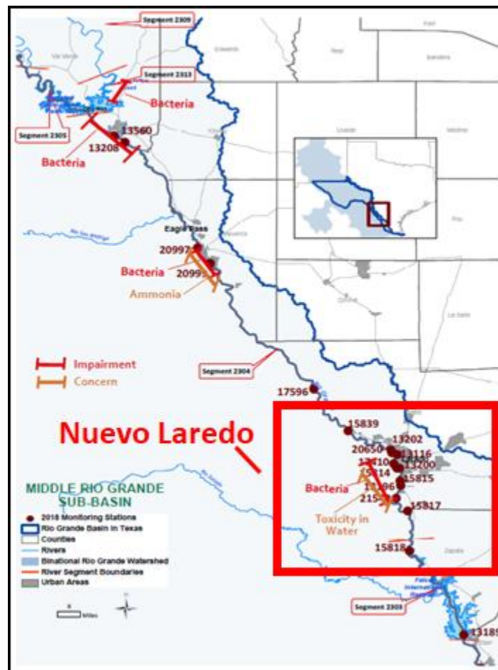
Figure 6 RIO GRANDE WATER QUALITY IN SEGMENT 2304

According to the 2018 Basin Summary Report for the Rio Grande Basin in Texas, the section of the river between the city of Laredo, Texas and the municipality of Nuevo Laredo, Tamaulipas, is impaired for bacteria and chlorides (from upstream) and shows concerns for toxicity. 10 In fact, although classified for contact recreation, this use is not allowed in this portion of the river due to high bacteria levels. Figure 6 shows the entire segment 2304, as shown in the aforesaid report, with the area highlighted for the general location of Nuevo Laredo.